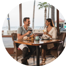
6 Avalon Grille 423 Crescent Ave. 310.510.7494 VisitCatalinaIsland.com