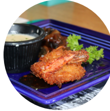
3 Steve's Steakhouse & Seafood 417 Crescent Ave. 310.510.0333 StevesSteakhouse.com