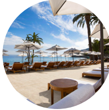
2 Descanso Beach Club 1 St Catherine Way 310.510.7410 VisitCatalinaIsland.com