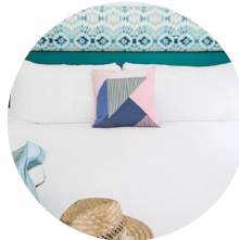
7 Bellanca Hotel 111 Crescent Ave. 310.510.0555 BellancaHotel.com