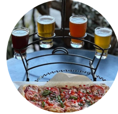
4 Catalina Island Brew House 417 Crescent Ave 310.339.8085 CatalinaBrewHouse.com