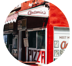
5 Original Antonio's Pizzeria & Deli 114 Summer Ave. 310.510.0060 AntoniosCatalina.com