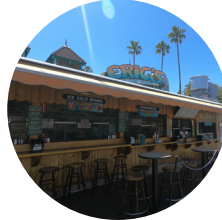
3 Eric's on the Pier Green Pleasure Pier 310.510.0894