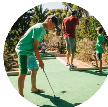
8 Golf Gardens 10 Isle Plaza 800.626.1496 VisitCatalinaIsland.com