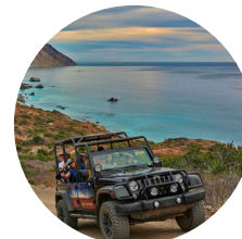
9 Catalina Island Conservancy Eco Tour 708 Crescent Ave. 310.510.2595 CatalinaConservancy.org