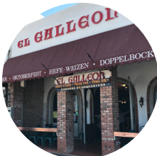
7 El Galleon 411 Crescent Ave.. 310.510.1188 ElGalleonRestaurant.com