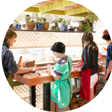
2 Silver Canyon Pottery 22 Pebbly Beach Rd. 310.499.8799 CatalinaTileExperience.com