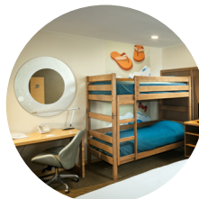
11 Catalina Canyon Inn 888 Country Club Dr. 310.510.0325 CatalinaCanyonInn.com