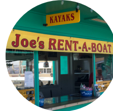
4 Joe's Rent A Boat Green Pleasure Pier 310.510.0455 JoesRentABoat.com