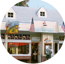
1 Original Jack's Country Kitchen 118 Catalina Ave. 310.510.1308 CatalinaHotSpots.com