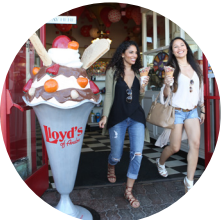
6 Lloyd's of Avalon 315 Crescent Ave. 310.510.7266 CatalinaCandy.com