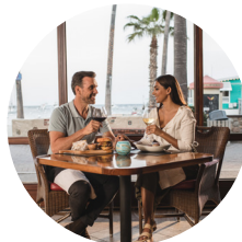
7 Avalon Grille 423 Crescent Ave. 310.510.7494 VisitCatalinaIsland.com