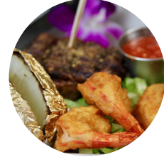
4 Steve's Steakhouse & Seafood 417 Crescent Ave. 310.510.0333 StevesSteakhouse.com