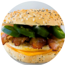
5 Catalina Coffee & Cookie Company 205 Crescent Ave. 310.510.2447 CatCookieCo.com