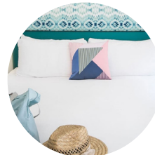
8 Bellanca Hotel 111 Crescent Ave. 310.510.0555 BellancaHotel.com