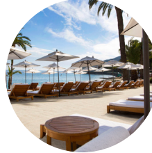
3 Descanso Beach Club 1 St. Catherine Way 310.510.2000 VisitCatalinaIsland.com