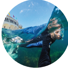
2 Catalina Divers Supply 1 Casino Way 310.510.0330 CatalinaDiversSupply.com