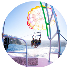
6 Island Water Charters Green pleasure Pier 310.510.9280 IslandWaterCharters.com